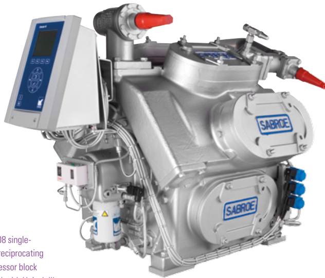
HPC 108 single-stage reciprocating compressor block (40 bar) with Unisab III systems controller